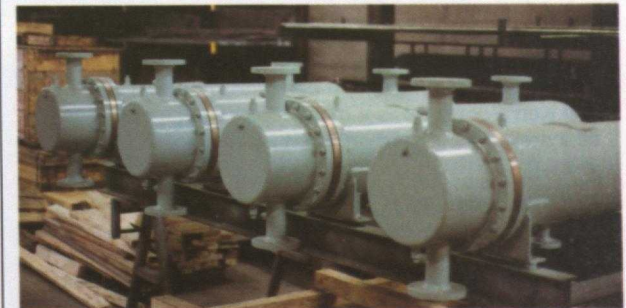
ISKO custom manufactures heat exchangers from such materials as carbon steel and copper for tough industrial applications.

ISKO engineers create heat exchangers with straight tubes, U-tubes, fixed and removable tube bundles; shell and tube type units; and other designs that best fit specific applications and meet ASME, TEMA, CSA, API and other relevant code requirements.