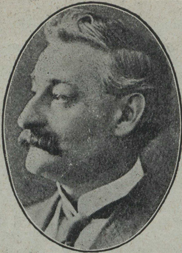
HON. MEDERIC MARTIN, M.L.A. Mayor of Montreal