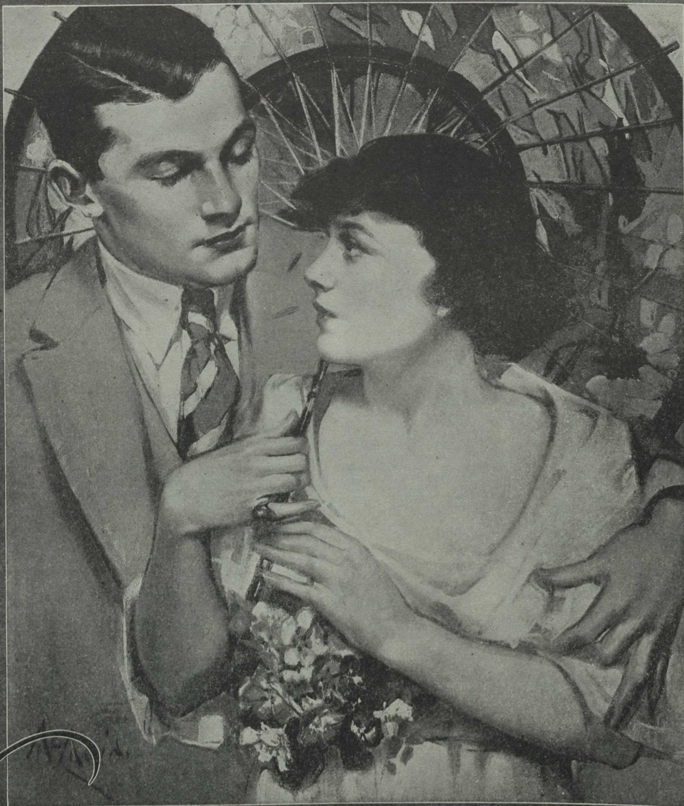
A Skin You Love to Touch Painted by Neysa McMein, 1917 The Andrew Jergens Co.