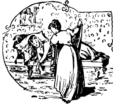
She lay on a couch like one dying.

small and yellow while her lips were as white as your collar. She was listless and apathetic and so weak she could not raise her hand to her head. A leading doctor forced her to