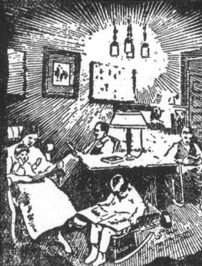
Lights the Home