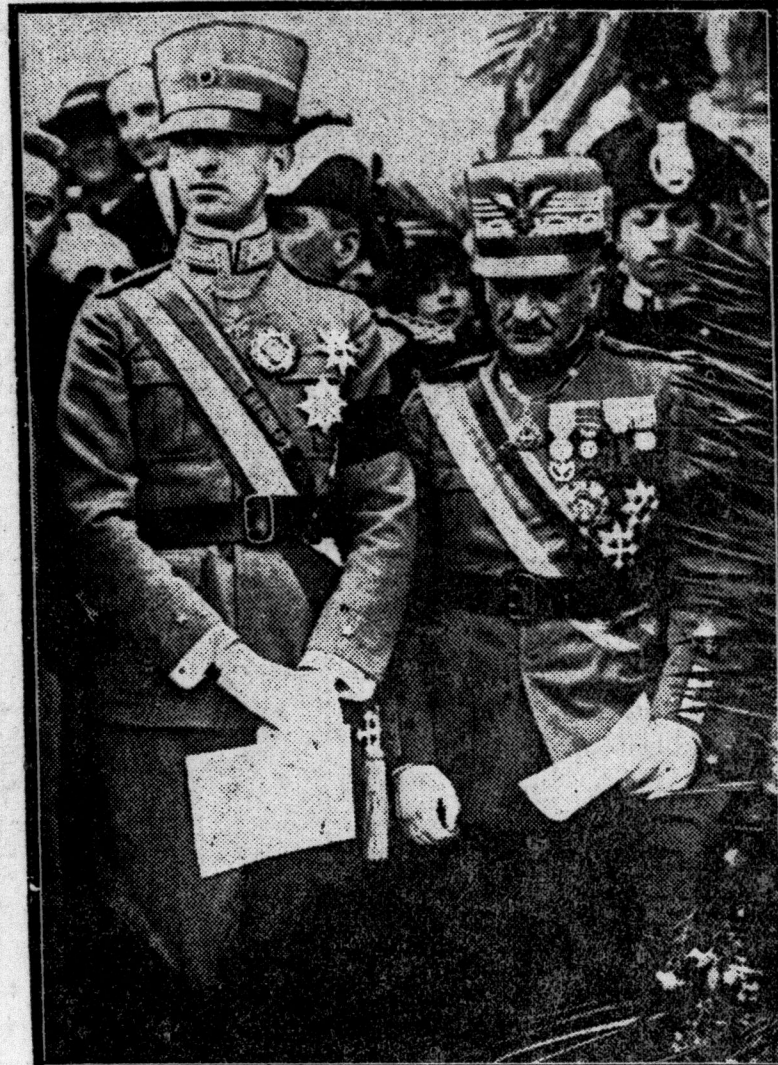
The triumvirate of new Italy. On the right of Premier Mussolini are Prince of Piedmont, heir to the throne, and General Diaz, Minister of War