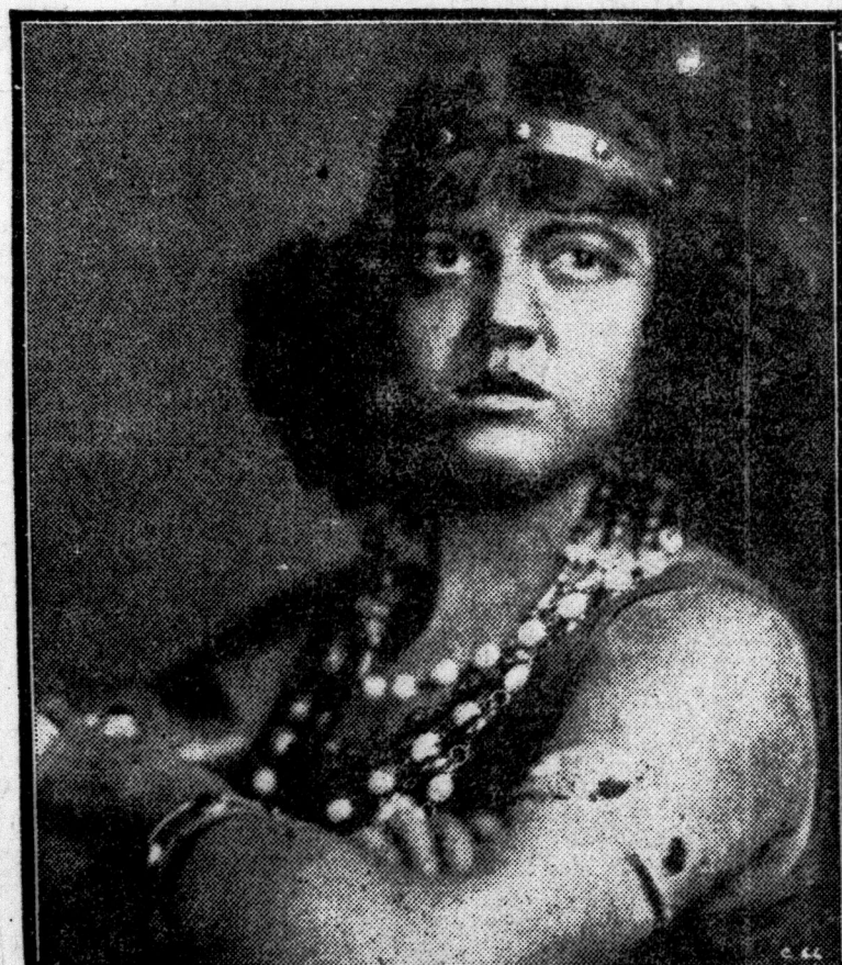
A striking photo of Rosa Ponselle, Metropolitan opera star, as Selika, the slave girl in the opera L'Africana which was brought out of the dusty archives and revived after it had not been heard of for 16 years