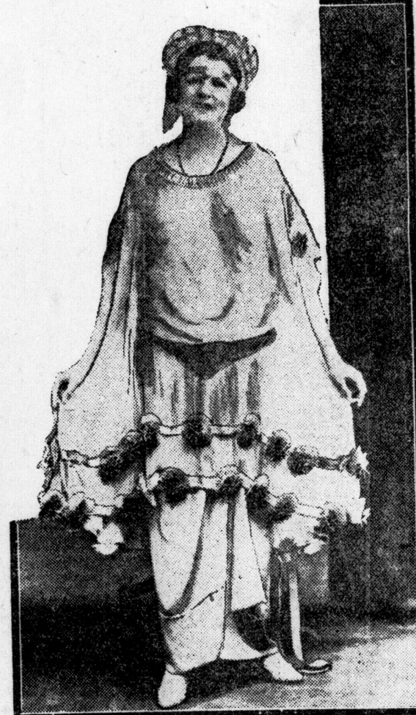
A beautiful negligee of white crepe de chine trimmed with wheels of mountain haze ribbon which was designed for Mrs. Warren Harding