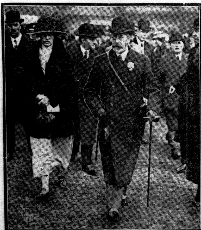
His Majesty in the paddock during the recent races, at Liverpool