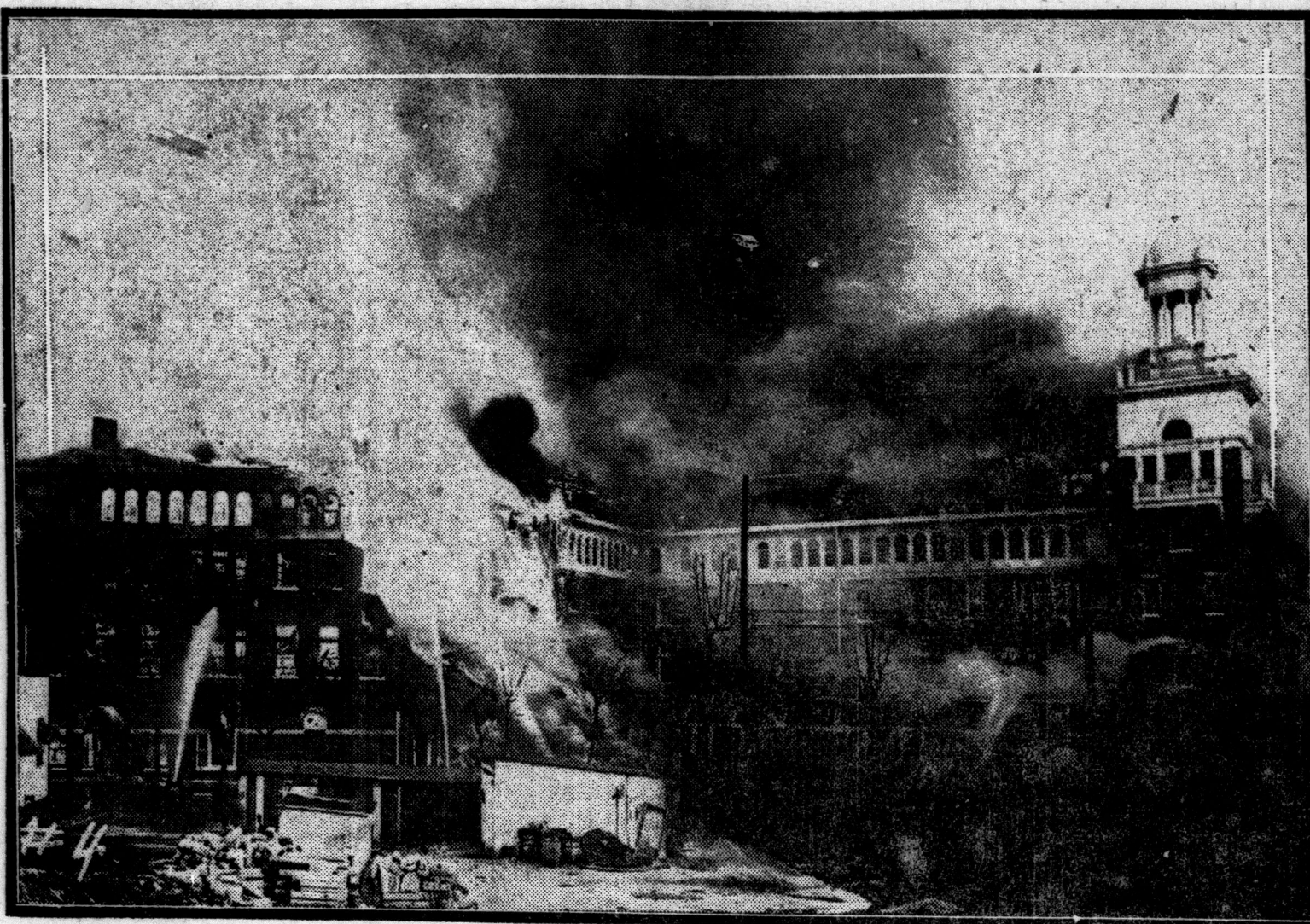
One fireman was killed and two injured when this hotel was burnt at Hot Springs, Ark. Many guests had narrow escapes and the total damage is well over half a million