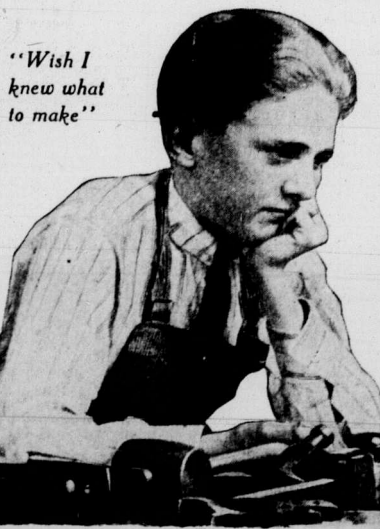
"Wish I knew what to make"

It is clearly printed on high grade book paper and durably bound in cloth. The cover is of an attractive design in four colors showing a boy building a small boat. There are ten solid pages of index alone. Neither care nor expense have been spared to make this the greatest boys' book published. It would be difficult to think of a way of investing $2.00 that would benefit a boy as much as through the purchase of one of these books. Copies will be sent postpaid by return mail.