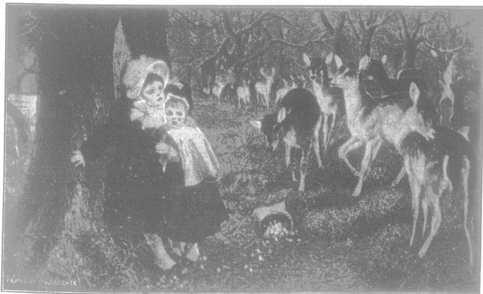
A THRILLING ADVENTURE.

One of the incidents in the progress of the Prince and Princess of Wales through India was the Prince's drive up the Khyber Pass without any guard except an escort of Afridis. This is the warlike tribe that gave the British Government so much trouble a few years ago to reduce to subjection, and the incident shows how completely these mountaineers have been won over to British rule.