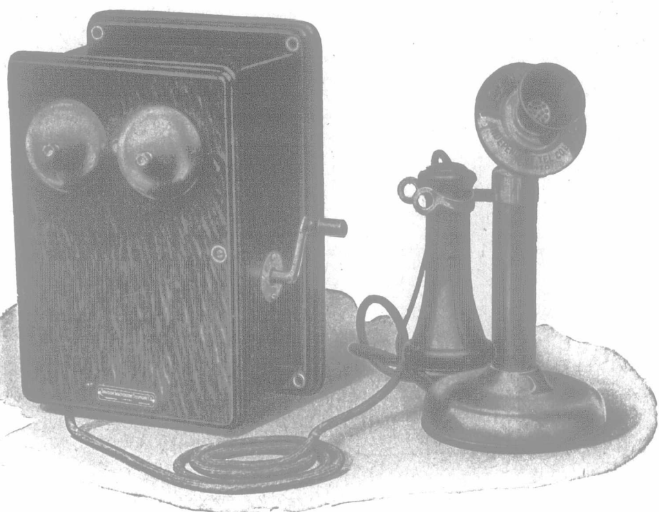
The Independent Desk Set.—The very latest thing in Magneto Desk Telephones