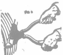
and are clamped in a three-flange stiff joint with a tool like this. Isn't that quick and easy? It is. There is no other way so good. Get Book.

EVERY farmer wants to reduce his taxes and statute labor. Pedlar's strong, non-rusting corrugated culvert saves excavation hauling and time, and makes a culvert that will not wash out or cave in like brick or cement. Much better than wood. Needs no attention. Time you now give to culvert repairs can be given to the road surface only. Learn about Pedlar culvert and how much better it is.