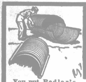
You put Pedlar's Perfect Corrugated Culvert up like this—right at the job

a Sample of the Easiest Laid, Strongest Frost-proof Culvert Ever Made for Farms and Roads, with Book of Facts.