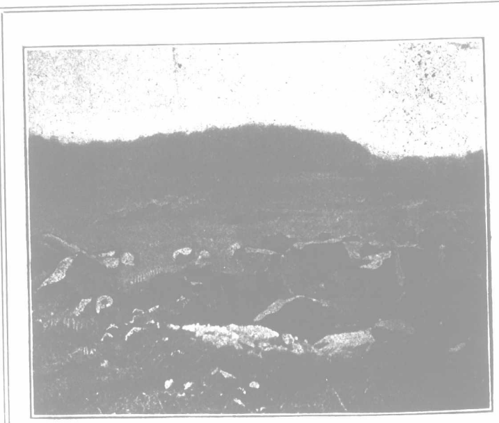
This is what happened to the boulder by using Stumping Powder.