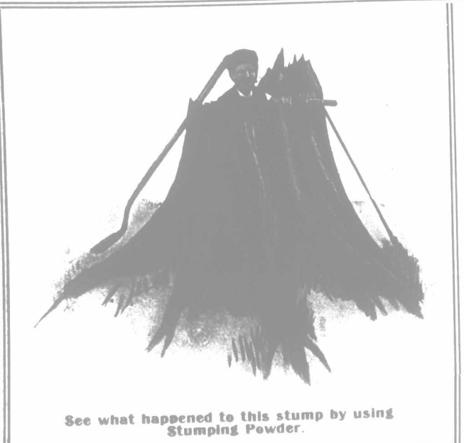
How About Those Stumps and Boulders of Yours?

Now is the time to clear your lands of the stumps and boulders which have been an eyesore to you for so long.