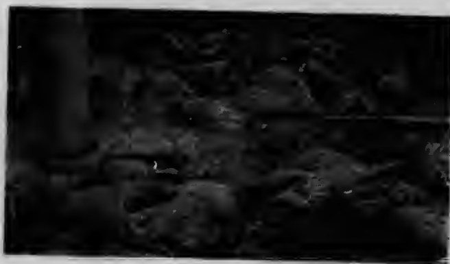
The work of sheep-killing dogs.

On the range it will pay to provide lambing-sheds and individual pens for the flock at lambing-time. A loss of about 15 per cent. of the lambs can be prevented by giving the necessary attention at this time. An experienced herder with a boy and horses can take care of 1,000 head on the range in open country. Good herders lose very few sheep or lambs by coyotes. Good dogs are a great help. A range