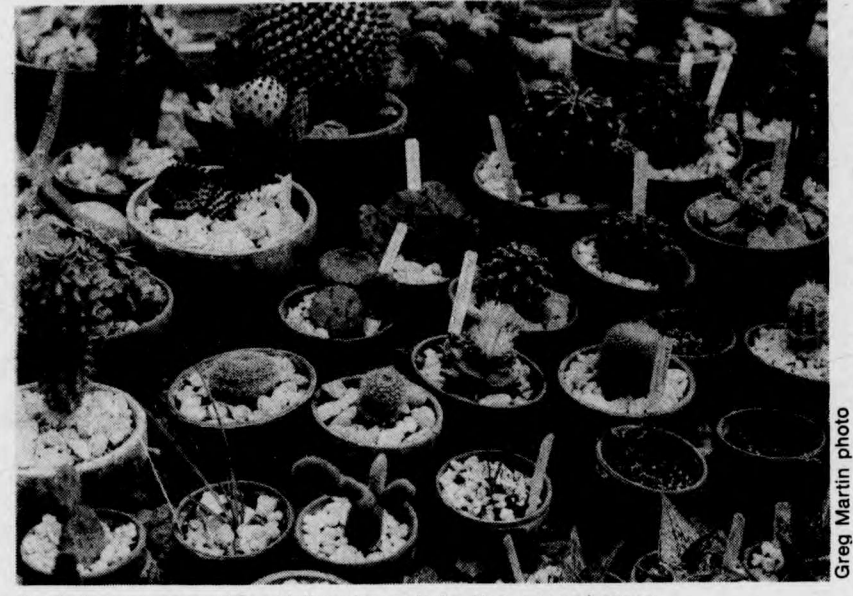
A vicious array of cacti lies in wait in the greenhouse.

enough water, the right size of pot he is not physically able to do all the and plenty of sunlight encourage