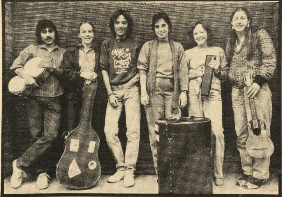
Latin American musical group Sabia will be performing a benefit concert for OXFAM-Canada along with local a cappella group Four the Moment Nov. 26 at 8:00 p.m. Tickets are $3 for students and $5 for general admission and are available at the Dal SUB Enquiry Desk and at OXFAM's office on Barrington Street. All proceeds will go to OXFAM's Nicaraguan Literacy programme which is the DSU charity for 1984-85.

• ANNUAL GENERAL MEETING of the Canadian Hostelling Association - Nova Sco-