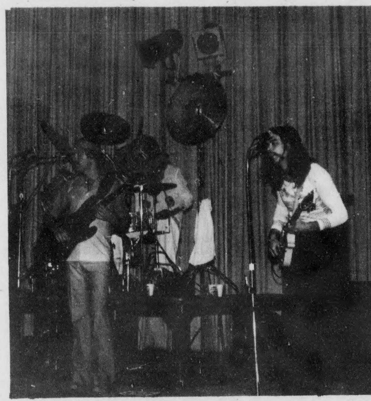
One of the bands that entertained at Extravaganza.

hot topic around the campus, one research grant as well as paying which was largely dropped due to him legal expenses. budgetary restraints.