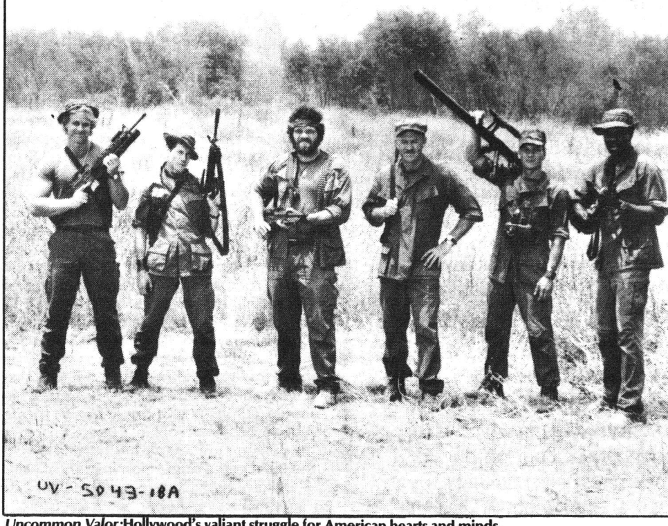
Uncommon Valor:Hollywood's valiant struggle for American hearts and minds.

kneed liberals wrought by not letting them "win" the war.