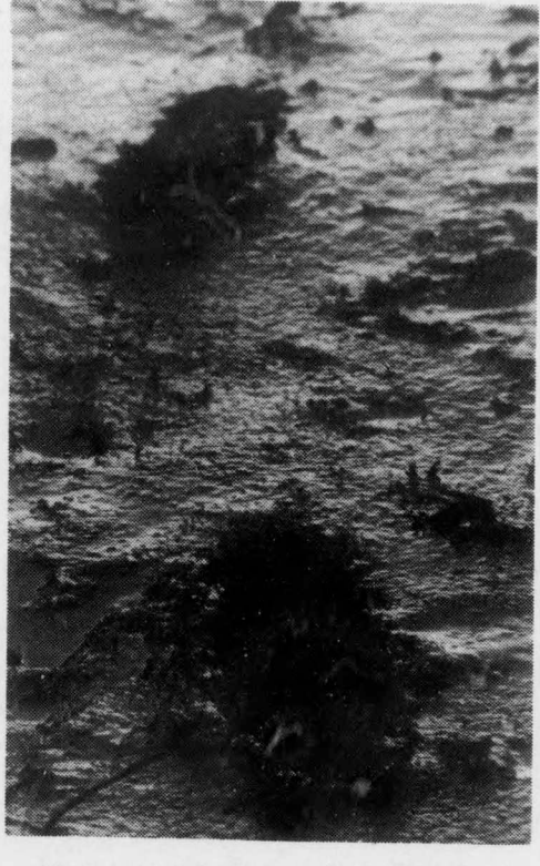
Mudprints in the Goose River Salt Marsh

3) Here comes the tricky part. After hiking all the way into the cove, walk around and look north, up the river and past the salt marsh - now it's option time. I chose to hike up the east branch until the riverbed turned into rock. On the east side of the river you will find a small sliver of orange flagging tape. Follow the tape strips (up and over the mountain that splits Goose River) and at the end of this little jaunt (about two kms)