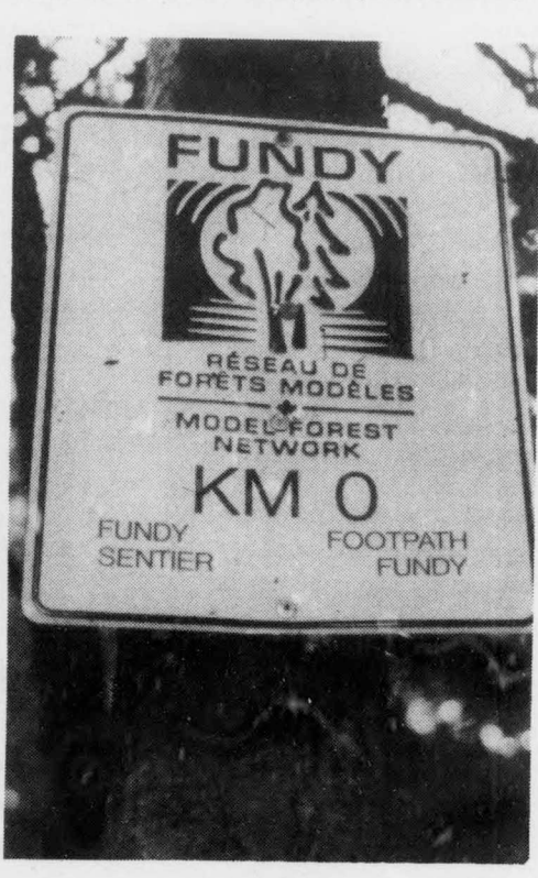
The First Step

overheard an interesting comment from one of the gentlemen with whom I live.