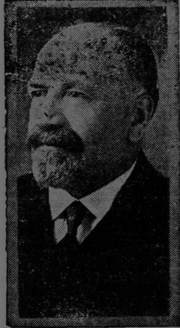
Minister of municipal affairs in Alberta, who defends Albertas' municipalities in respect to their bonded indebtedness.