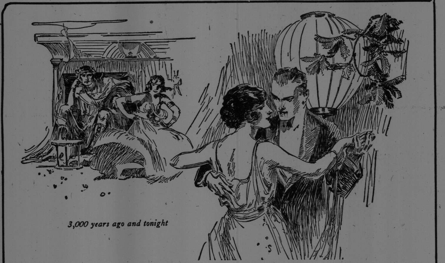
3,000 years ago and tonight