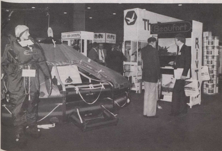
Edmonton's large trade facility offers ample space for displays.

Delta; the Canadian Institute of Mining — Petroleum Society's thirty-sixth annual conference; and the Alberta Oil Sands Technology and Research Authority Heavy Oil and Oil Sands Conference, with the theme of advances in petroleum recovery and upgrading technology.