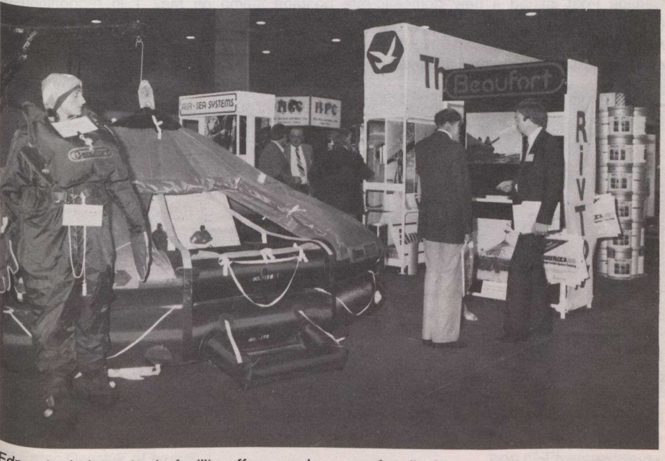
Edmonton's large trade facility offers ample space for displays.

Delta; the Canadian Institute of Mining — Petroleum Society's thirty-sixth annual conference; and the Alberta Oil Sands Technology and Research Authority Heavy Oil and Oil Sands Conference, with the theme of advances in petroleum recovery and upgrading technology.