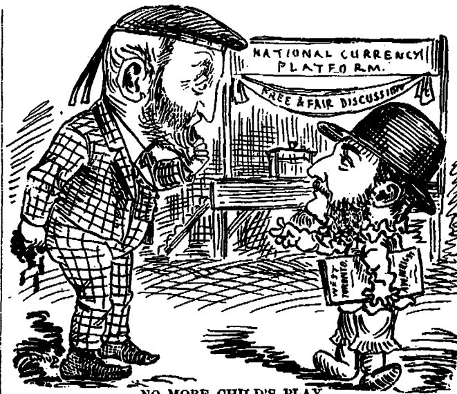
NO MORE CHILD'S PLAY.

Sir A. T. Galt.—"My usefulness is gone." I might as well return to Canada. The Military Attache.—By no means, sir, don't think of it! What would I be without you!!