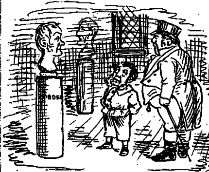
Young Canada Abroad.

Studio, 118 KING ST. WEST, TORONTO. vii-22-1y.