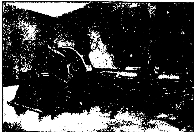
SIDE CRANK IDEAL DIRECT CONNECTED TO GENERATOR.