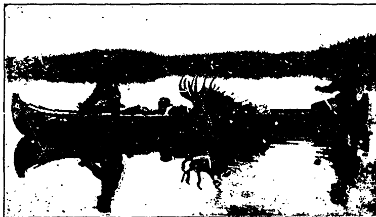
BRINGING OUT A KIPPEWA HEAD.