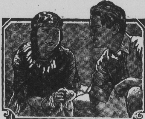
COLLEEN MOORE and LLOYD HUGHES in "The Huntress"

- Also - THAT DROLL FELLOW CLYDE COOK - In -