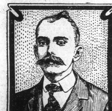
573 James St., North, Hamilton, Ont.