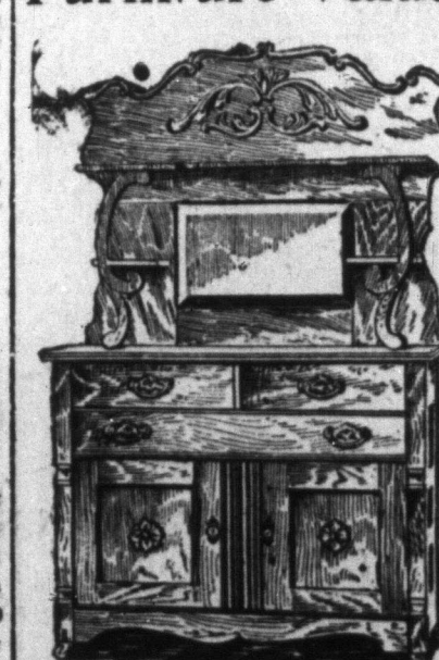
OUR $11.00 SIDEBORD.

While we sell Furniture cheap, it does not imply that we sell "cheap" inferior Furniture.