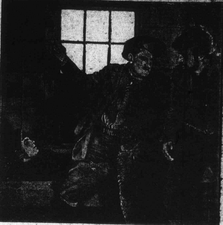
Fastened the Noose to His Neck.

Approaching night found the three still upon the trail. Drawing in his horse the Spider spoke.