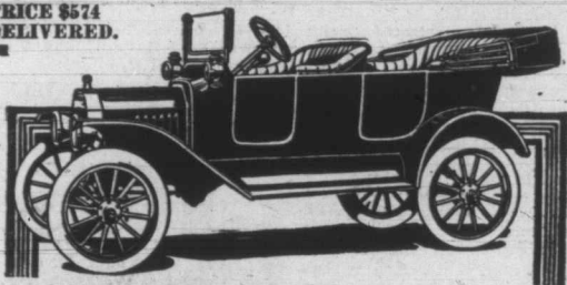
5 Passenger, Ford Touring, 1916