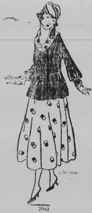
A Sports Frock Developed in the New Plain and Dotted Silks

Nothing has been more talked of in the past seasons than sports clothes, so much so, that nowadays we have come to be an essential part of the modern woman's wardrobe, a rule, bright coats or blouses are worn with white or light colored skirts. Included in the list of gray does that are used, red is often found, which is rather unusual, as this color has been looked upon formerly as more appropriate for fall and winter than for spring and summer. Sports clothes of silks and satins appear in greater numbers this season than those of cottons. There are, however, some novelties in cottons which promise to prove very popular. One of these is cotton, gathered brightly striped and plaid in colors. Basket weaves which have the new striped and dotted designs also have a fair showing, and the heavy linens will undoubtedly be worn. The sketch shows one of the favorite models with the smart hip-length blouse. Stitched box pleats, start-