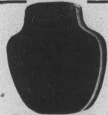
Regist. red design.

THE W. H. MALKIN CO., LTD., of Vancouver, for British Columbia. Ruttan & Chipman, of Winnipeg, for Manitoba, Alberta and Sask. The Harry Horne Co., of Toronto, for Ontario. F. L. Benedict & Co., of Montreal, for Ottawa and Eastern Canada.