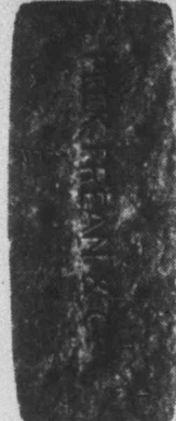
Carbon Chor. Sandwich.