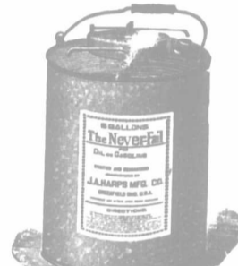
3 and 5 Gal. Imperial Measure