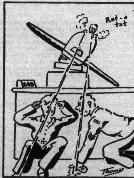
"Who let that armament man in here?"

The primary theoretical and practical instruction the student pilots are taught at