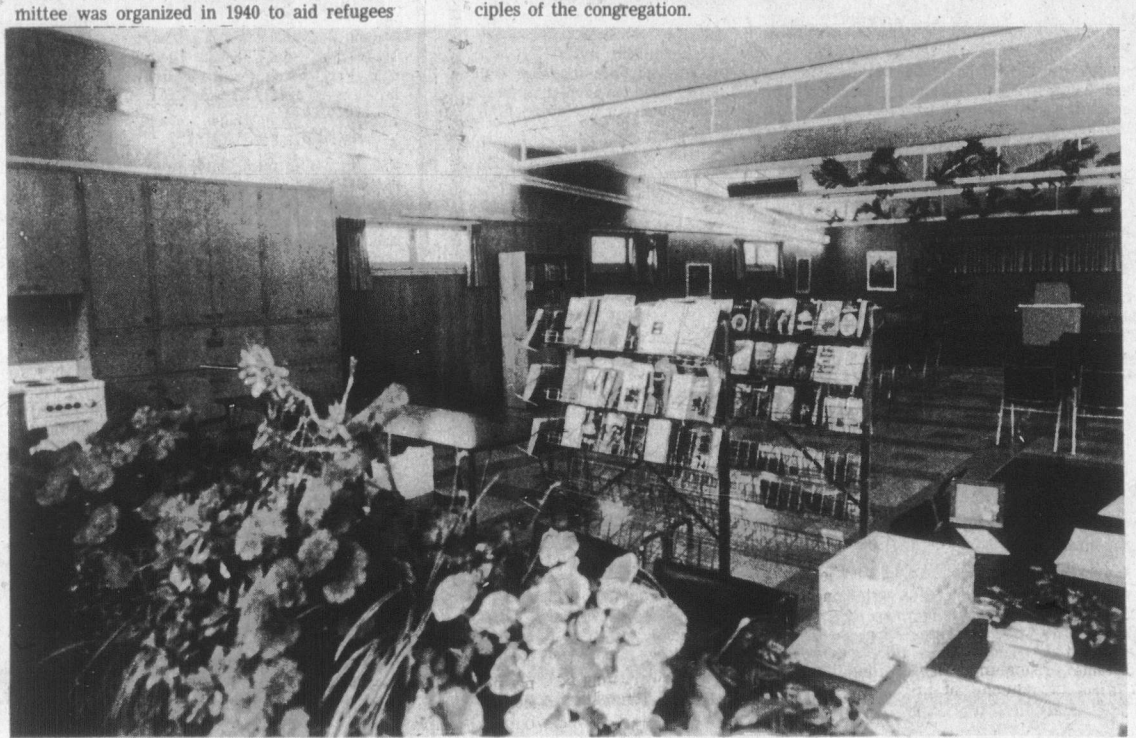
Informality is the flavor inside the South Peel Unitarian Church where Sunday Services are held in a spirit of learning with discussion.

Members of the Unitarian Congregation of South Peel built their own church at 84 South Service Rd. in 1956. Unitarian Universalists, unlike other religions, have no set dogma of what they must believe in. Most do not believe in God as a supernatural being but believe in the things associated with god such as peace and love