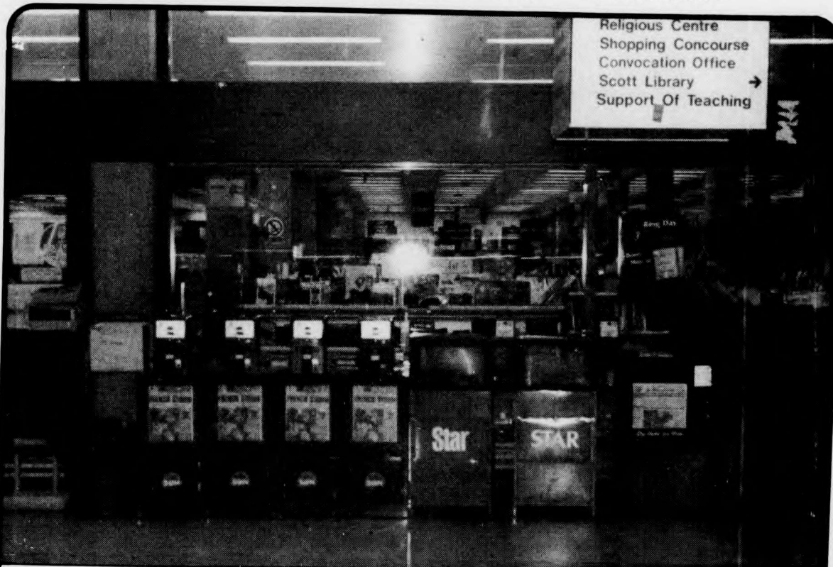
Observe the ratio of Toronto Sun boxes to Toronto Star boxes to Globe and Mail boxes in Central Square. Hmm, what are the sociological implications here?

of character and the promising new ethos which women engender will tower over such mindless retaliations toward their right to at least an equal share in humanity's thought, art, politics, identity and future.