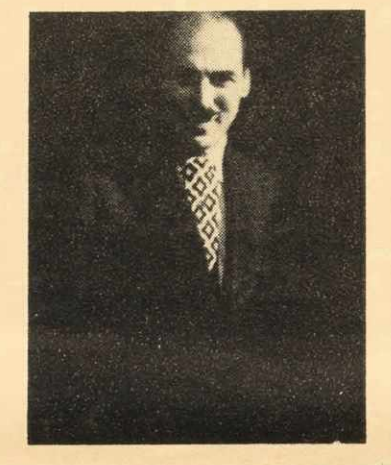
Here's Mandrake!