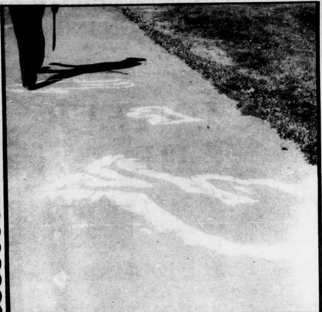
only the shadows know. A grim reminder of those who died over 41 years ago in Hiroshima & Nagasaki