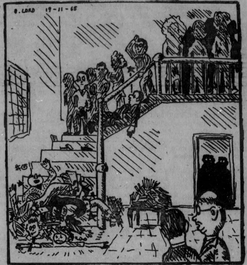
"We forgot the rotary sign again".

sham and hypocrisy that are so abundant in our Western society. Saint John is home and there is no better place to start. At the moment we are enjoying a clean, white snowfall. The bright lights of Christmas sparkle through the evening and people bustle through the stores laden with surprises for that magic date. Yes, it is magic that our city and merchants can spend $20,000 on lights. This is real spirit while shoeless children standing in thin coats look wistfully up at the symbol of the true Christmas. Moving away from Saint John