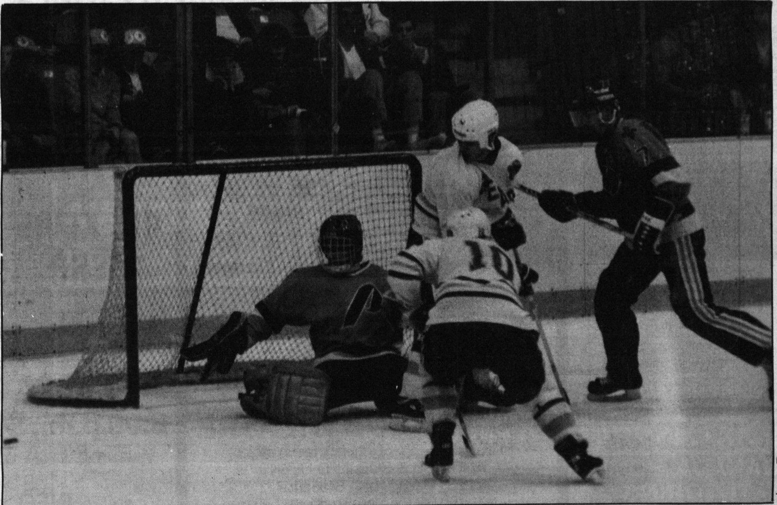
The Golden Bears' opening game goes Thursday night at 8:30. It'll be a rematch of last year's championship game against the Patriotes from Trois Rivieres. Alberta won last year by a 5-2 score.