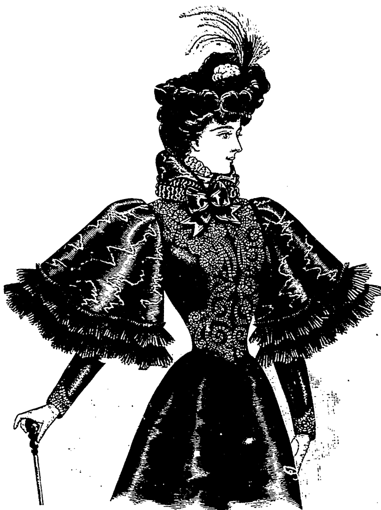
FIGURE NO. 167 B.—This illustrates LADIES' HUSSAR JACKET.—The pattern is No. 9372, price 1s. or 25 cents.