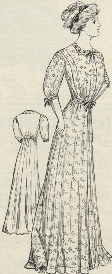
Pattern No. 6395

HERE is a negligee that is dainty and becoming and attractive at the same time that it is comfortable. It is made of dotted Swiss muslin and is trimmed simply with beading threaded with ribbon. It is open all the way down the front and it can be slipped on and off with perfect ease yet it gives the effect of a gown and it is quite appropriate for the home breakfast table. Any pretty lawn or batiste, flowered muslin or material of the sort will be found appropriate, the thin Japanese silks are much used for the purpose, and, if a very picturesque effect were wanted, one of the silks woven in real Oriental design could be utilized. Beading threaded with ribbon makes a satisfactory and practical finish but