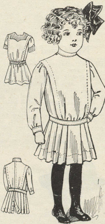
Pattern No. 6762

For the 10 year size will be required 5 yards of material 27 inches wide,