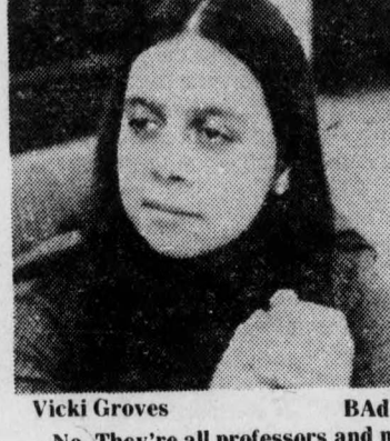
BAd 2 No. They're all professors and no