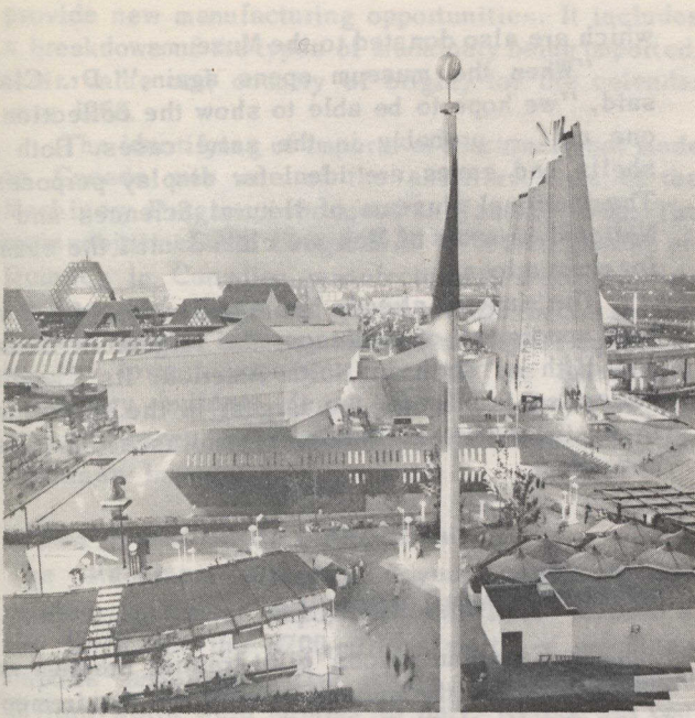
Expo 67, the biggest candle on Canada's birthday cake during centennial year.