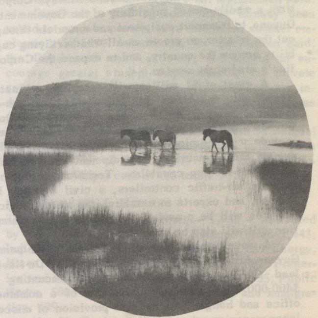
Some parts of Canada remained largely unchanged through the decade, like Sable Island where, despite the coming and going of an exploratory oil drill rig and its crew, during 1967, the wild horses continued to roam in isolated peace and tranquility.