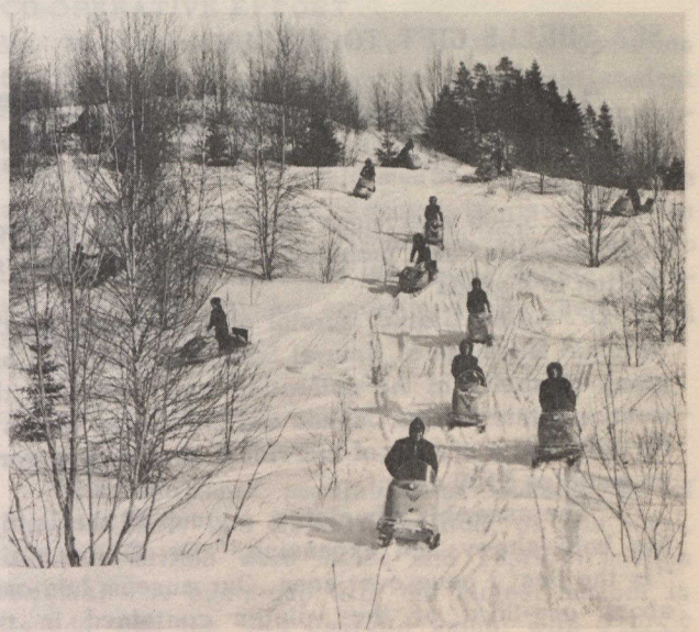
The snowmobile provided Canadians with a new sport during the Sixties and, up north, the machine replaced the dog-sled.