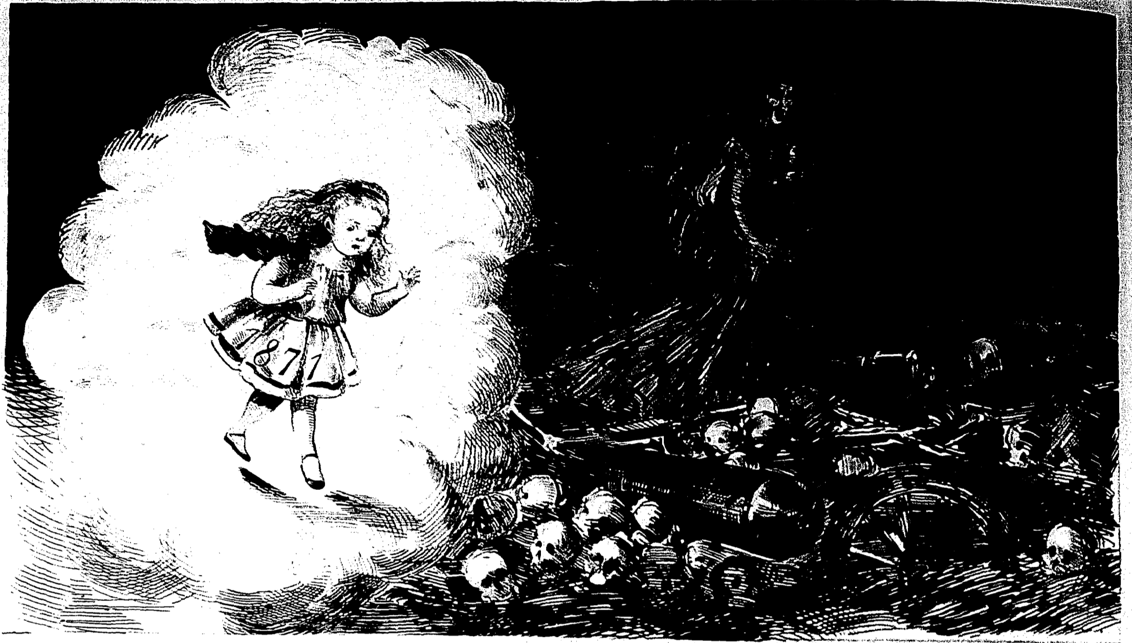
THE NEW YEAR'S DEBUT.