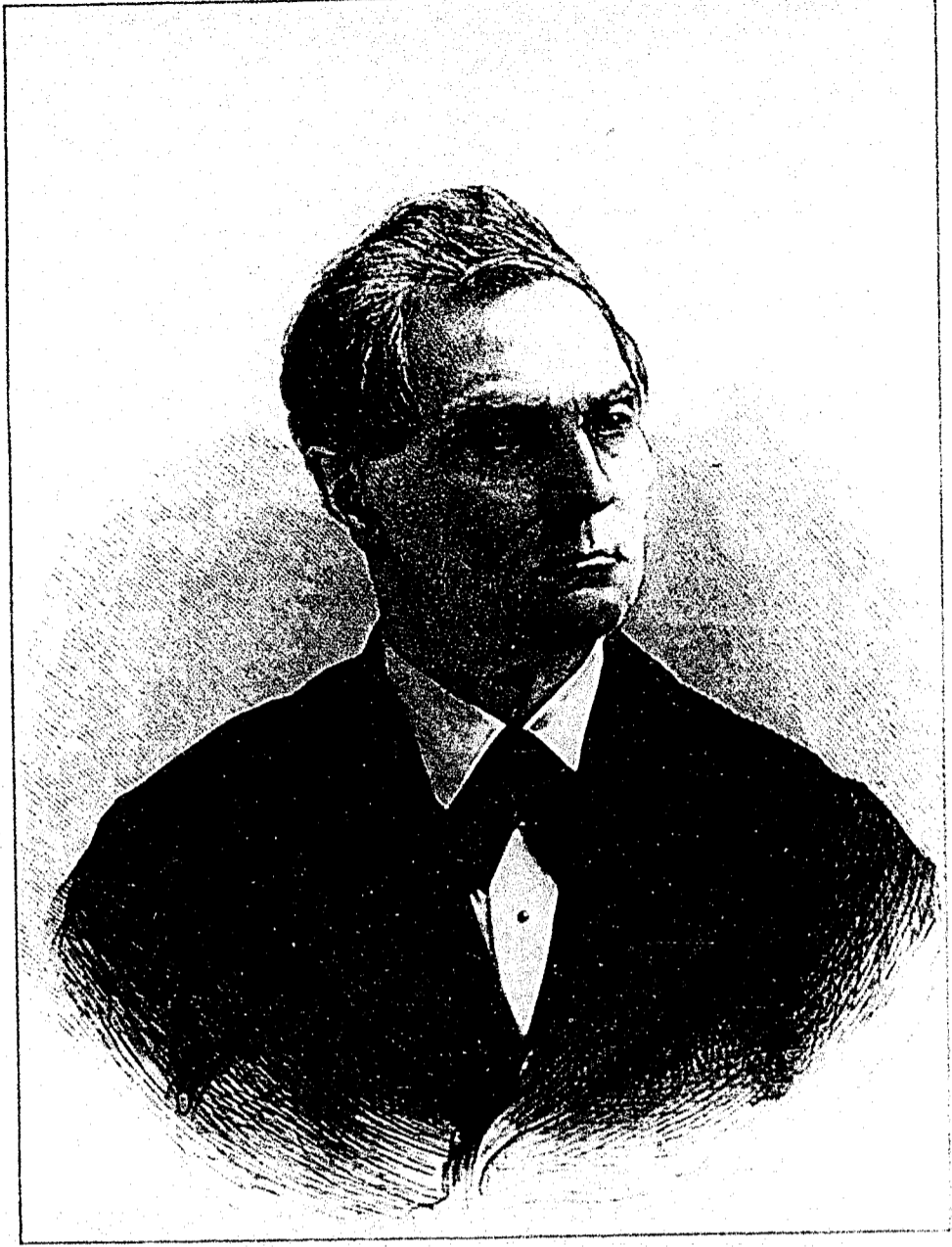
THE HON. RUTHERFORD B. HAYES, OF OHIO.