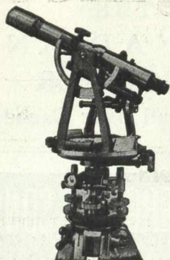
Type BP—5 inch limb

With a cheap inefficient instrument and do an inferior grade of work, the accuracy of which is always open to question, and without credit to yourself.