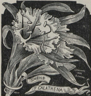
THE GREAT ISMENE