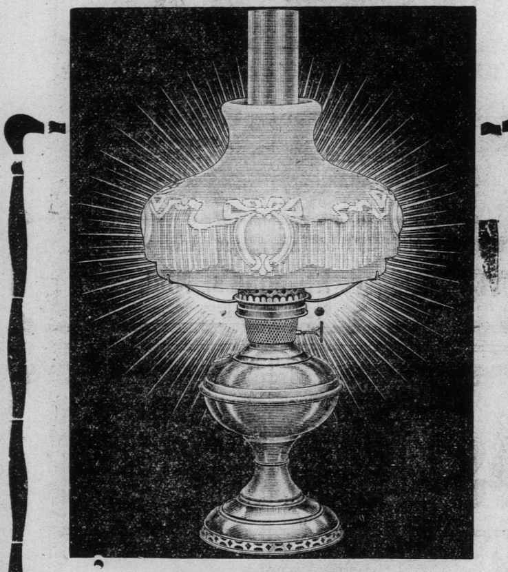
THE ABOVE LAMP is now being offered as a premium FREE of all cost for tags and coupons only. Send us a Post Card with your name and address

and we'll mail you all particulars by return.