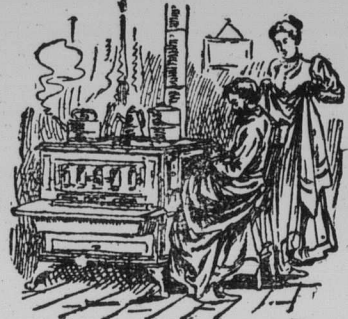
"HAD TO SIT WITH FEET IN A HOT OVEN."

Life is truly a burden to those not blessed with a full measure of health and strength, but when a strong man is brought to the verge of almost utter helplessness, when doctors fail, and there is apparently nothing left to do but wait the dread summons that comes but once to all, the case assumes an aspect of extreme sadness.