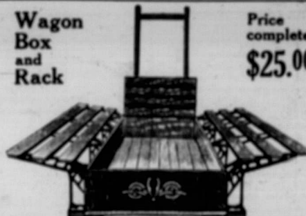
Wagon Box and Rack

If you are going to invest in any new machinery for getting your crop of hay or grain ready for the market it is a wise fore-thought to order early—NOW. The EATON implements have taken a strong hold in the West, both by reason of their sterling qualities and their marvellously low prices. Farmers are realizing more clearly every day the far-reaching influence on prices that has been felt ever since EATON'S entered the field of Farm Machinery and Binder Twine.